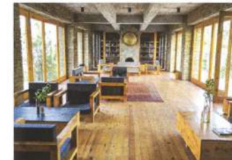
A room this serene is a just lovely to get reading

Just like the car, The Kumaon is beautiful not just on the inside. Their library is the perfect place to pick up a book and relax in the mountain sunshine, surrounded by birdsong and the fragrant smell of pine. The restaurant,