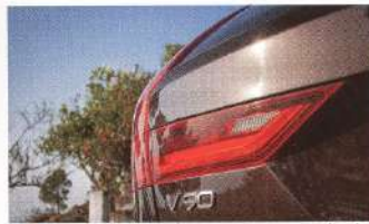
Simple and effective, the way it's supposed to be