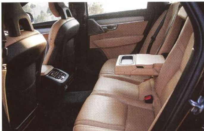
Central console ensures that rear passengers always have something to fiddle around with if bored

design philosophy has been pretty effective here.