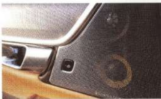
The surround sound will absorb you in total bliss

Mostly when one thinks of station wagons, at least in India, they remember Roshan Seth's ad for the Tata Estate in the mid-90s or a shape they never call beautiful. I think the nice chaps at Volvo must have gotten a similar response from other countries, barring the Roshan Seth ad obviously, and they decided to change that perception. I have to admit, they have done a brilliant job of it. No one can look at the V90 and call it a boring, old station wagon. If they do, I think they need a swing from Mjolnir to bring them back to their senses. Muscular, sharp and extremely good looking; those are the words you should be using when you see the V90 Cross Country. History is witness to the fact that it is not easy to turn a station wagon into something good looking, but Volvo's recent