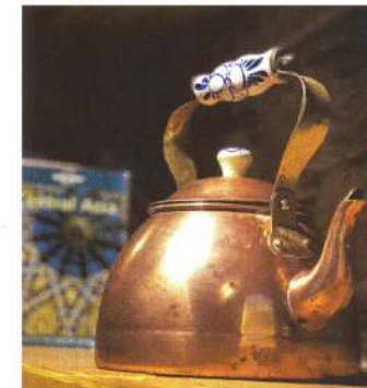
Rustic and homely seems to be the overall theme

again stunning to look at or scary if you stand right at the edge, serves delectable food - ranging from local cuisine to continental. The staff are attentive, and despite it being a huge property, are always around to serve you a steaming hot cuppa. For the adventurous, there are village trails nearby which you could embark on to view a variety of flora and fauna. The property manager tells me there is a thriving leopard population around and if I am lucky, I might spot one a couple of metres away. I'm sort of glad at being unlucky on this trip.