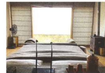
The perfect view to wake up to each morning