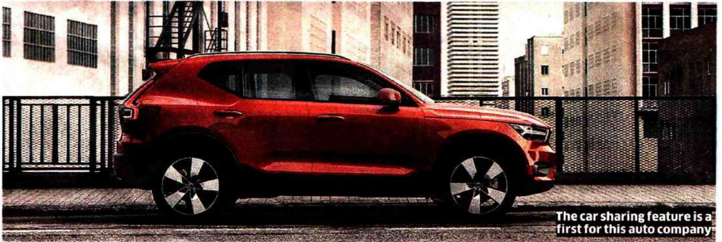
The car sharing feature is a first for this auto company

Safety, practicality and comfort are everything you can expect from this vehicle