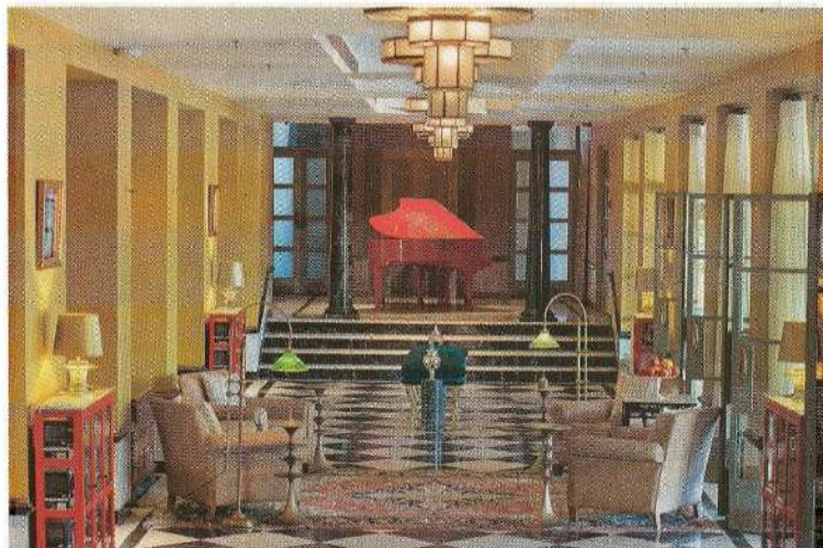
Question is: does that piano have an invisible player as is fashionable now?