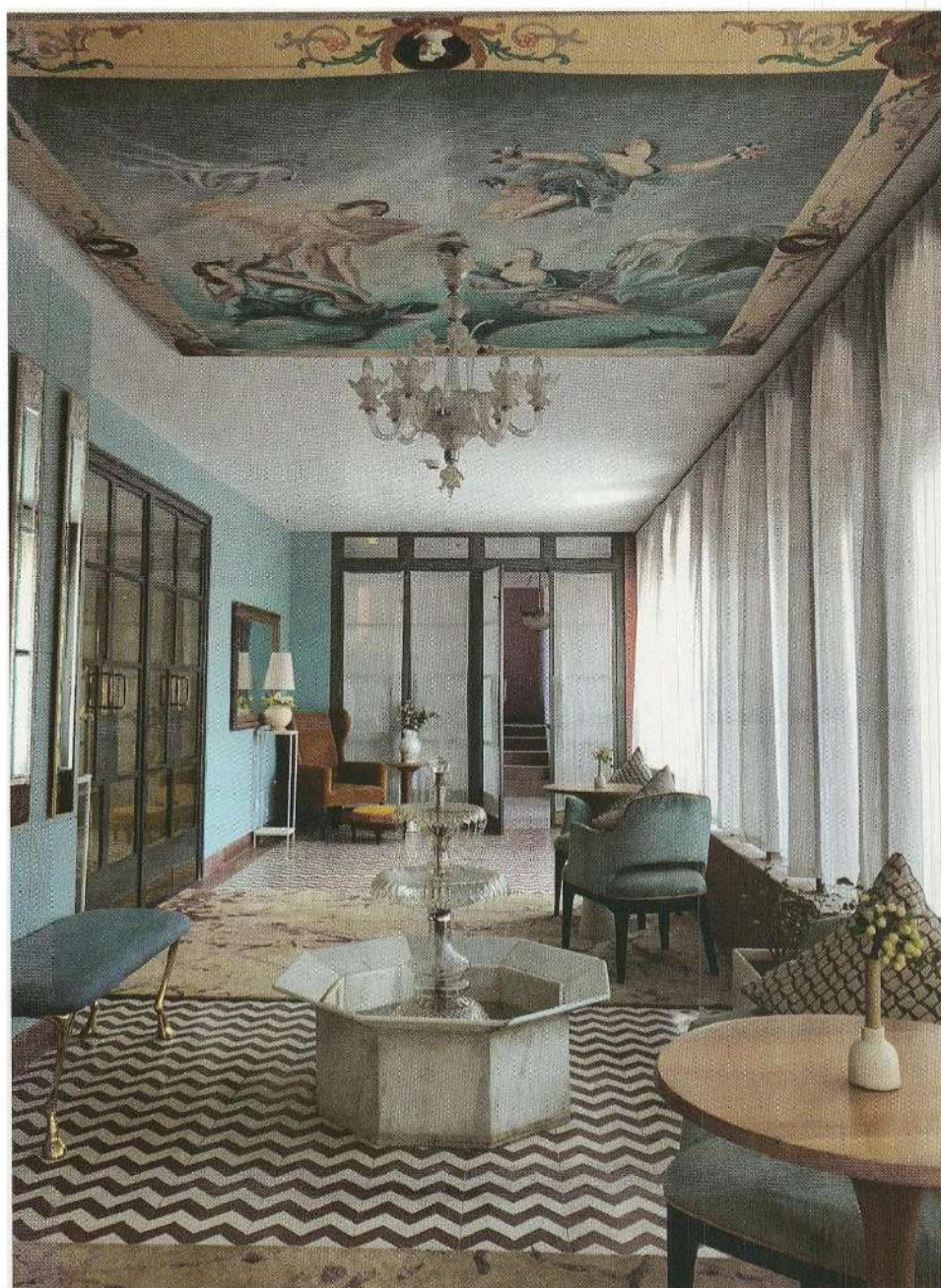
One of the highlights of Narendra Bhawan is the spa. An absolute must-visit to calm your nerves

The interiors of the XC60 are also a place where these two words live up to their meaning. The seats are best in the business, thanks to orthopedically designed contours and high-quality Nappa leather and luxury is pretty much the theme across the cabin. High quality knurled knobs, drift wood inlays with ash finish, chrome and piano black finish are all used to good effect. The front seats are powered and come with an extra cushion that extends to