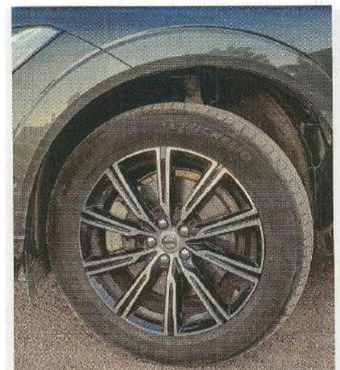
Large, chunky wheels to fit the car's profile