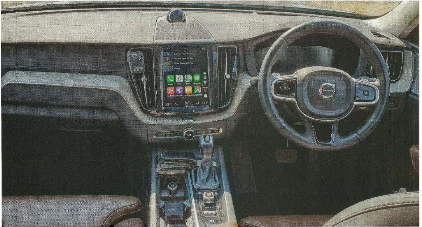
The thing that Volvo does oh-so-well nowadays is the balancing act between minimalism and opulence. A solid case in point is this, the XC60

Since we were heading out in search of luxury, the ride for this trip had to be luxurious. Again, luxury not in the sense of faux wood on the dash or quilted leatherette seats but luxury the way it is meant to be. I don't think there is anything better than the XC60 in its segment and the 1000 km return trip only proved me right. The route we took to Bikaner was part NH and part SH, but there was hardly a stretch which I could call bad. The 234 bhp and 48 kgm motor in the XC60 was more than sufficient for our trip and the levels of refinement on the XC60 are pure luxury. Even at higher speeds, you can barely hear anything inside the cabin. There are four driving modes to choose from and even in Dynamic, which lowers the ride height and stiffens the car, the car is calm and composed. It might sound difficult to believe, but we were in Bikaner in time for lunch having left Delhi at 6am amidst considerable fog.